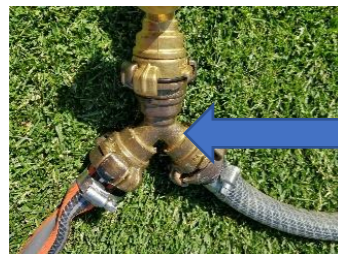
This is a "bayonet" fitting